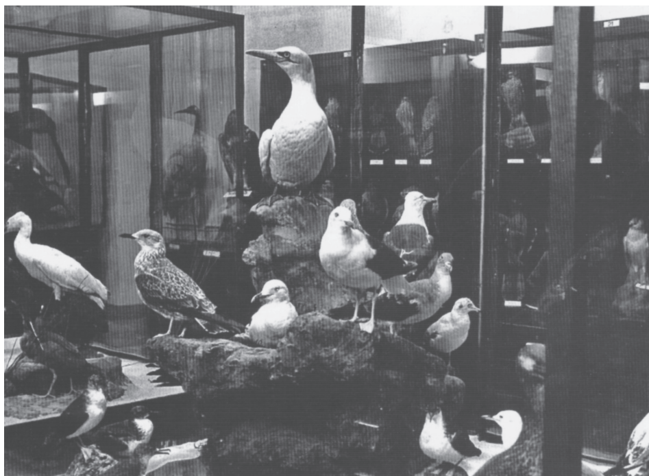
Fig. 2 - One of the cases from the former Museo Libico di Storia Naturale, set up in Tripoli in 1936. It is possible to recognise several stuffed specimens of seagulls, shearwaters, one gannet, Morus bassanus (L., 1758), one little egret, Egretta garzetta (L., 1766), and in the background one common crane, Grus grus (L., 1758), and perhaps a golden eagle, Aquila chrysaetos L., 1758. None of these birds are now on display in the Tripolitanian Assaray Al-hamra Museums (from GIULIANO, 2009).

Libyan ornithofauna has been further penalised by the tangible impoverishment of the scientific material that originally made up the collections of the museum (Fig. 2). The latter have, in fact, been drastically reduced not only in relation to the reports on the same made during the Italian occupation of Libya (cf. CORÒ, 1940), but even in relation to the information transmitted in much more recent times by some of the zoologists who found themselves working in the North-African state (cf. MASSETI, 2010). To cite just one mammalian example, of the three stuffed cheetahs, Acynonix jubatus (Schreber, 1776), exhibited in the museum at the beginning of the 1970s (cf. HUFNAGL, 1972), only one is still on display. This specimen was prepared by the Italian taxidermist Giuseppe (Beppe) Giuliano (11st June 1911-4th December 1974), who worked in Tripoli from 1933 to 1970, the year in which the new Libyan government decided to repatriate all the Italians (GIULIANO, 2009) (Fig. 3). He was the principal taxidermist involved in the creation of the Italian collections.