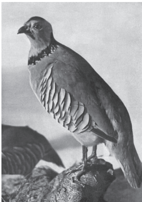
Fig. 1 - Stuffed Barbary partridge, Alectoris barbara (Bonaterre, 1792) (from CORÒ, 1940).

Moreover, in the course of recent decades, the study of