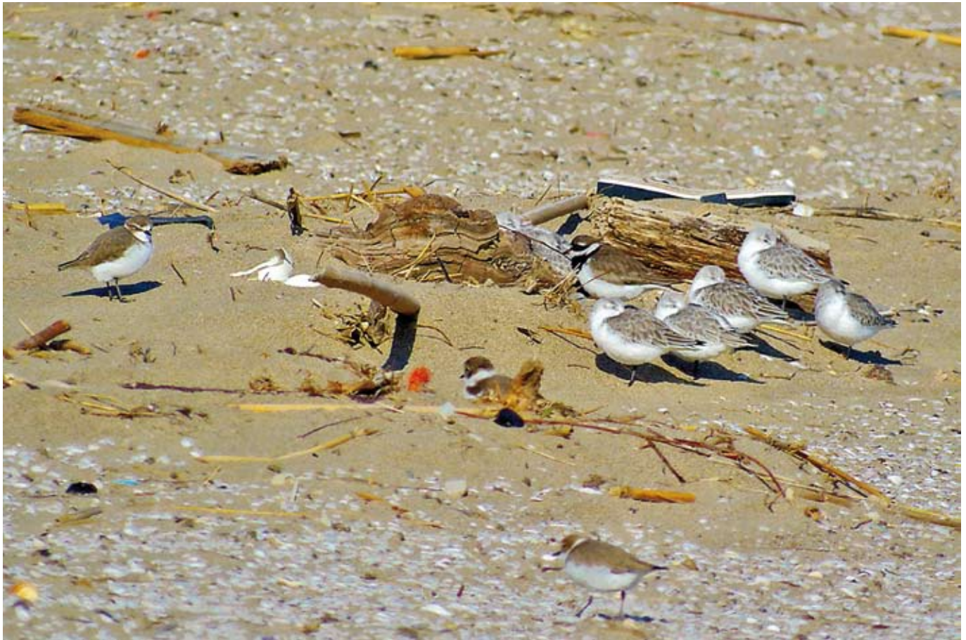
Fig. 6 - Hetero-specific flock composed of C. alexandrinus , C. alba and C. hiaticula . / Gruppo etero-specifico formato da C. alexandrinus , C. alba e C. hiaticula .