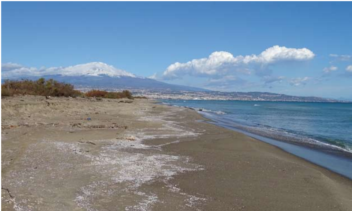
Fig. 2 - A typical stretch of sandy coast of Catania's Gulf, with Etna Mount on the background. / Tipico litorale sabbioso del Golfo di Catania, con l'Etna sullo sfondo.