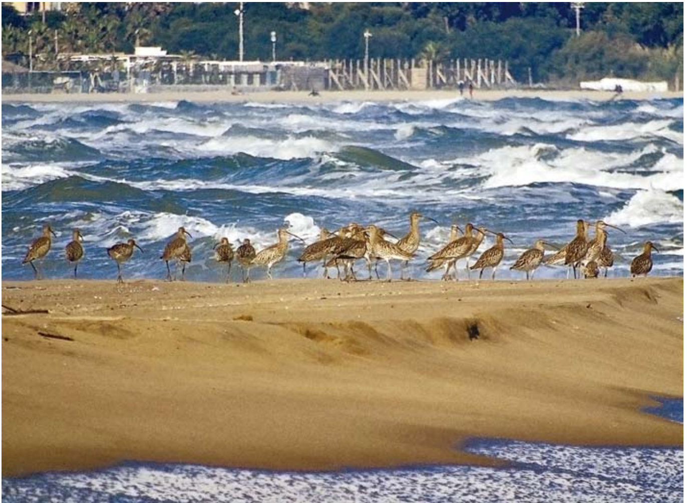
Fig. 5 - Flock of Eurasian curlew photographed in January 2019. / Gruppo di chierli maggiori fotografato a gennaio 2019. (Photo: / Foto: D. Grimaldi).