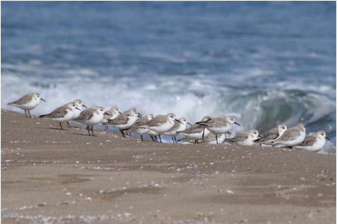
Fig. 4 - Flock of Sanderling photographed in January 2015. / Gruppo di piovanelli tridattilo fotografato a gennaio 2015.

Observed for seven winters, usually in small groups of 2-4 ind., mainly in the second part of the decade; none observed in 2012-2013 and in 2015. Estimation for 2011-2015 of 1-5 ind. and 2-7 ind. for 2016-2020, with averages respectively of 2 (1.6) and 5 (4.6). Very low IKA, from 0 (2012-13, 2015) to a maximum value of 0.63 (2019-20). The 1% of the national wintering population is fixed to 55 individuals (Zenatello et al. , 2014), therefore the area hosted a really low percentage.