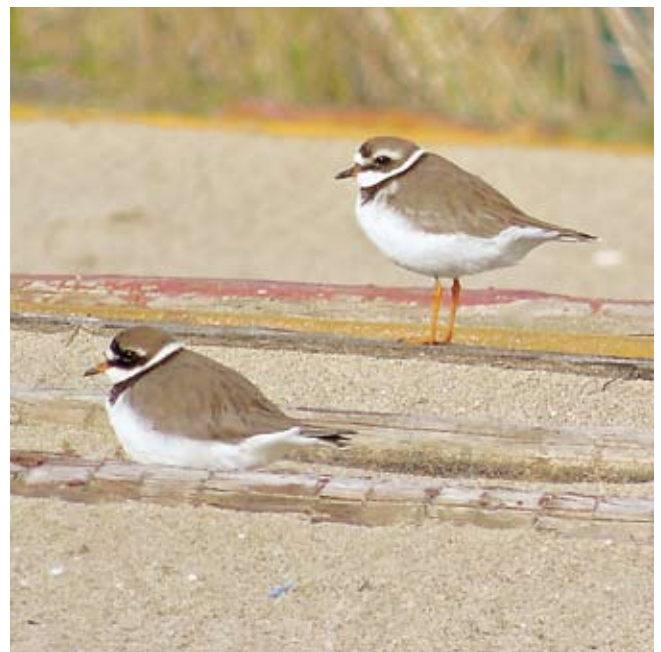
Fig. 3 - Common ringed plovers resting near to Canale Arci's mouth in January 2017. / Corrieri grossi a riposo nei pressi della foce del Canale Arci a gennaio 2017.

Regularly observed every year, usually in groups of 10-20 individuals, mainly near freshwater stream mouths; very constant numbers through the years, with maximum of 23 individuals recorded in 2012 and exactly 22 observed in 2013, 2014, 2015 and 2017 as well. A peak of 51 was recorded on 10 January 2016: 31 together at River San Leonardo's mouth, Transect 4, and 20 at Canale Arci's mouth, Transect 2: these sites resulted the most important along the coastline of Catania's Gulf for