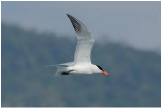
Fig. 9 - Caspian Tern Hydroprogne caspia , 5 May 2016. / Sterna maggiore Hydroprogne caspia , 5 maggio 2016.

Chlidonias hybrida Whiskered Tern. Regular but fairly-scarce migrant. 1-5 ind annually observed (Apr-May). One observation in summer (1 ind on 1 July 2009 - DP).