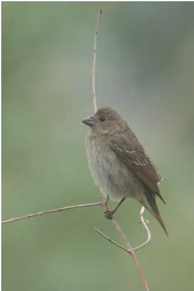
Fig. 14 - Common Rosefinch Carpodacus erythrinus , 27 April 2017. / Ciuffolotto scarlatto Carpodacus erythrinus , 27 aprile 2017.

Monticola saxatilis Common Rock Thrush. An ind captured in the agricultural fields on 11 April 1978 (EP).