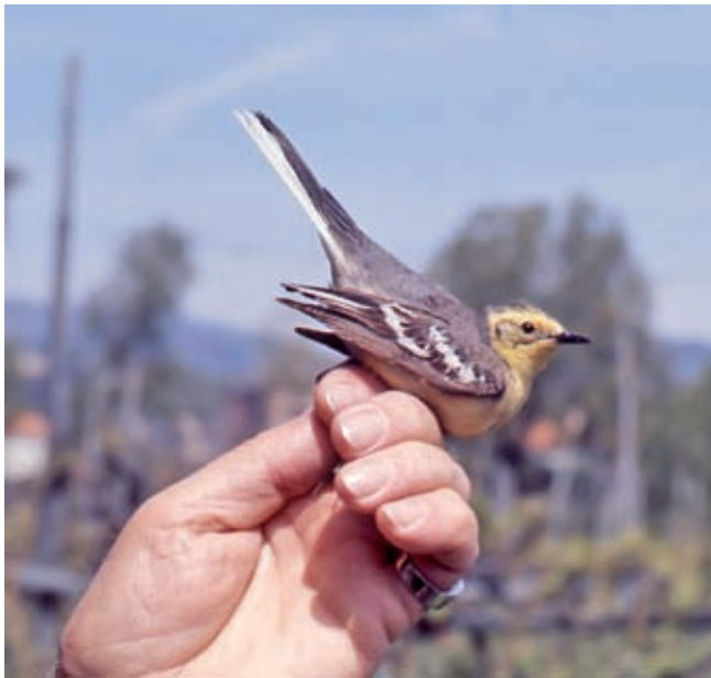
Fig. 13 - Citrine Wagtail Motacilla citreola , 2CY m ringed on 1 May 1976. / Cutrettola testagiolla orientale Motacilla citreola , 2CY m inanelata il 1 maggio 1976. (Photo / Foto Emilio Podestà).