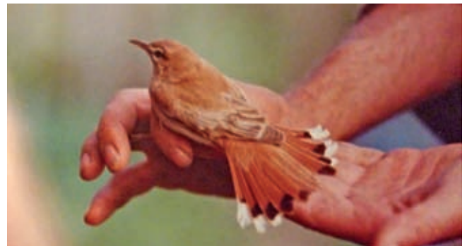
Fig. 12 - Rufous-tailed Scrub Robin Cercothricas galactotes galactotes ringed on 16 May 1983. / Usignolo d'Africa Cercothricas galactotes galactotes inanellato il 16 maggio 1983.

Cercothricas galactotes Rufous-tailed Scrub Robin. An ind of the nominate subspecies ringed on 16 May 1983. It was the 6 th regional record and the 26 th known for the Italian peninsula (Spanò & Truffi, 1984) (Fig. 12).