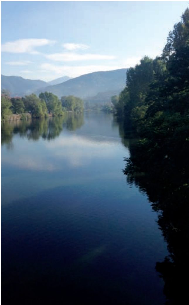
Fig. 3 - The river. / Il fiume.