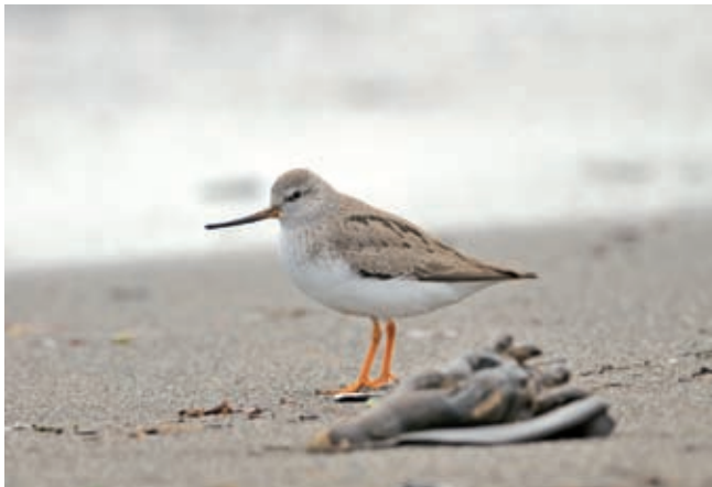
Fig. 8 - Terek Sandpiper Xenus cinereus , 10 May 2010. / Piro-piro del Terek Xenus cinereus , 10 maggio 2010.

Xenus cinereus Terek Sandpiper. An individual observed on 10 May 2010 at the river mouth (MB, ER, DP) (Fig. 8).