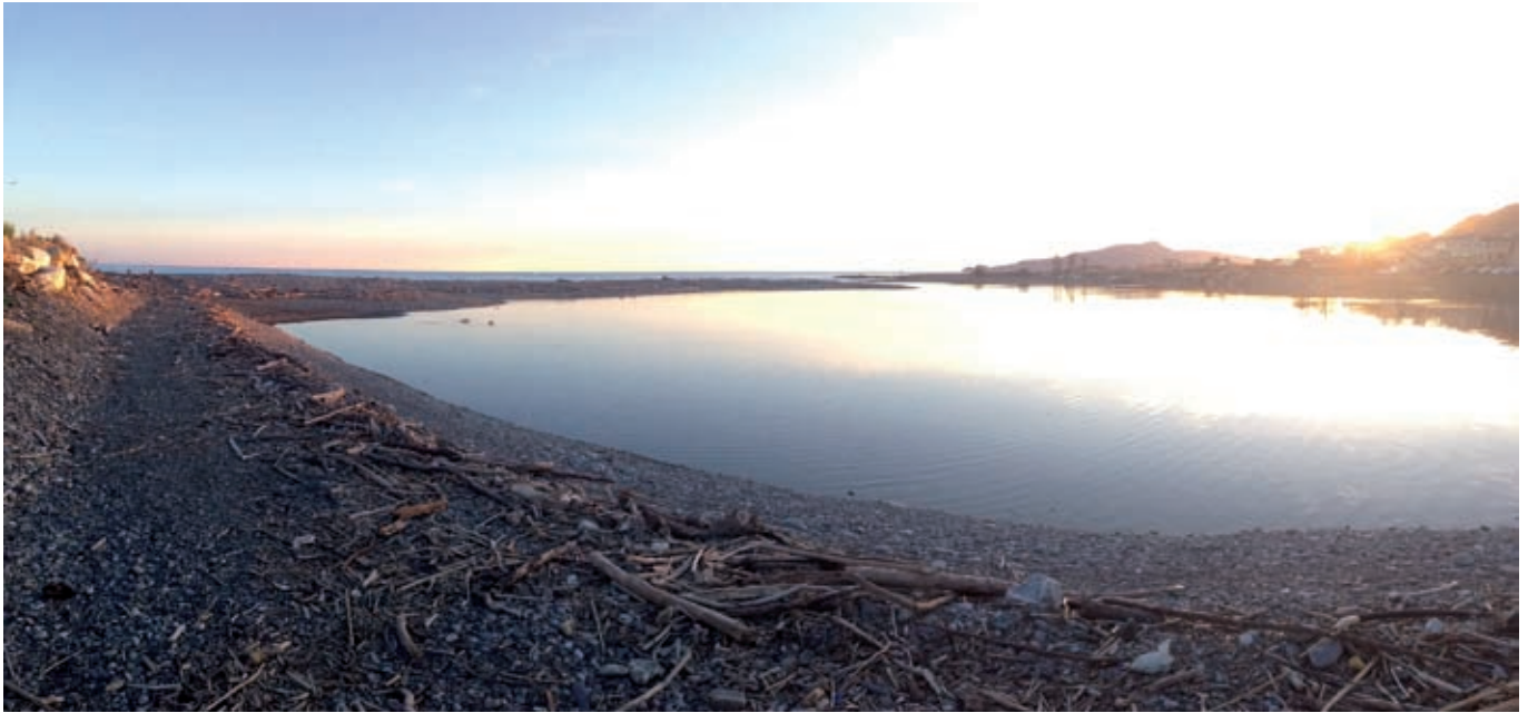
Fig. 2 - The mouth. / La foce. (Photo / Foto Andrea Simoncini).