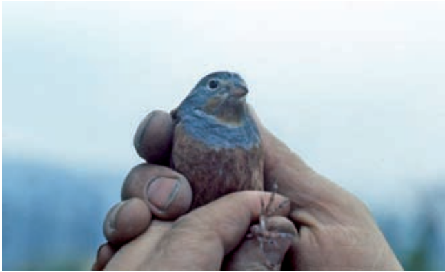
Fig. 11 - Cretzschmar's Bunting Emberiza caesia , ad m ringed at the end of April 1979. / Ortolano grigio Emberiza caesia , ad m inanellato alla fine di aprile 1979..

Emberiza hortulana Ortolan Bunting. Regular migrant, the species showed a marked decline throughout the years reflecting the general decrease of the species (Birdlife International, 2017). The annual number of ind observed in the area dropped from c 400 in spring 1970 (EP) to the 3 ind in 2017 (AS).