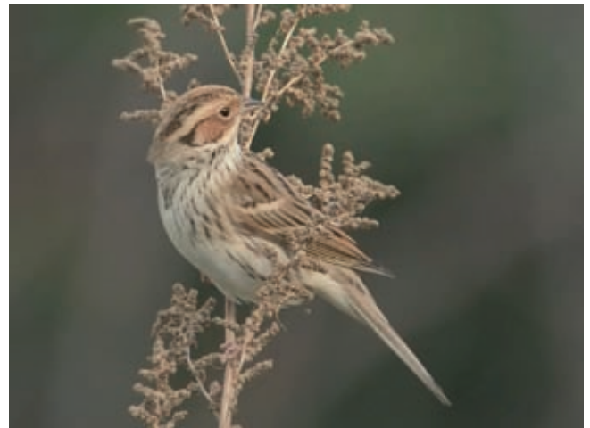
Fig. 15 - Little Bunting Emberiza pusilla , 15 December 2016. / Zigolo minore Emberiza pusilla , 15 dicembre 2016.

Plectrophenax nivalis Snow Bunting. 1 ind shot on October 1965 is preserved in the Rocca ornithological collection. Recently, 1 ind was observed at the mouth from 12 to 14 November 2010 (DP, ER).