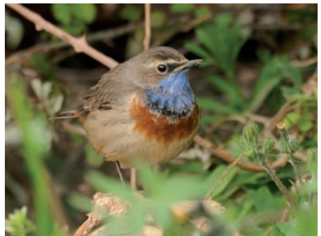
Fig. 10 - Bluethroat Luscinia svecica , ad m ssp. cyanecula , 28 March 2016. / Pettazzurro Luscinia svecica , ad m ssp. cyanecula , 28 marzo 2016.

Anthus campestris Tawny Pipit. Observed annually in the fields with 15-30 individuals and maximum gatherings of 10-15 ind (AS, DP, ER).