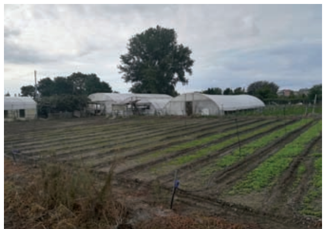
Fig. 5 - The fields. / I campi.