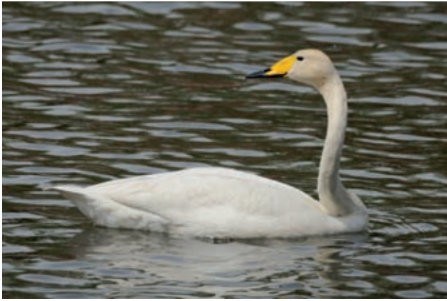
Fig. 6 - Whooper Swan Cygnus cygnus , 7 May 2015. / Cigno selvatico Cygnus cygnus , 7 maggio 2015. (Photo / Foto Andrea Simoncini).

observations in the area may not reflect its real abundance. Further studies are thus needed to assess the species' status. 2 known records from the Entella mouth: