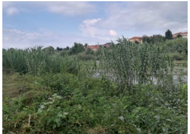
Fig. 4 - The riparian zone. / La zona rivierasca. (Photo / Foto Andrea Simoncini).