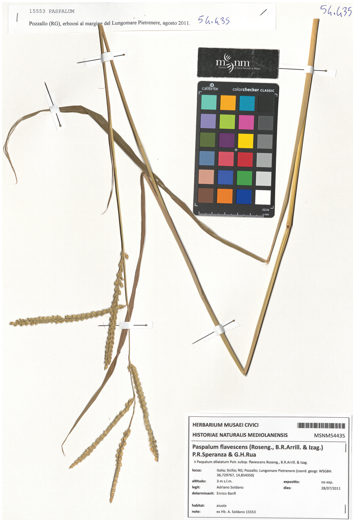
Fig. 1 - Paspalum flavescens (Roseng., B.R.Arrill. & Izag.) P.R.Speranza & G.H.Rua.