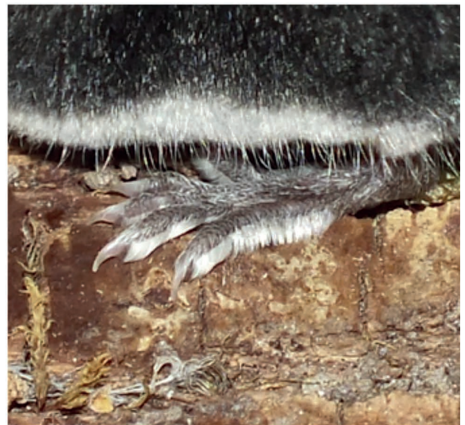
Fig. 2 – Tail and foot of Neomys milleri caught in the study area (left, photo: F. Ballanti) and N. fodiens from Val Masino, Sondrio province (right, photo: A. Nappi). / Coda e zampa di Neomys milleri catturato nell'area di studio (a sinistra, foto: F. Ballanti) e di N. fodiens della Val Masino, provincia di Sondrio (a destra, foto: A. Nappi).