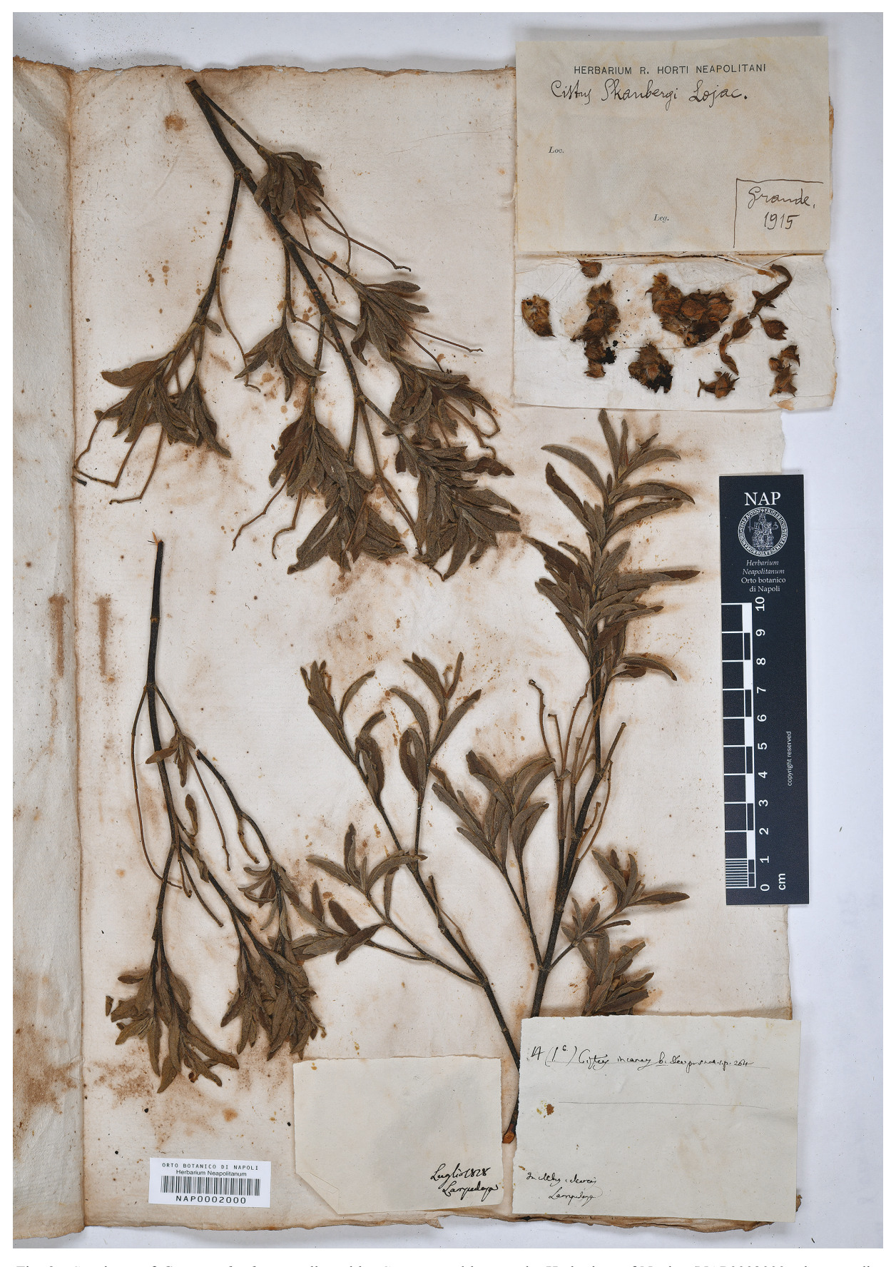
Fig. 3 - Specimen of Cistus × skanbergii collected by Gussone and kept at the Herbarium of Naples (NAP0002000). / Campione di Cistus × skanbergii raccolto da Gussone e conservato presso l'Erbario di Napoli (NAP0002000).