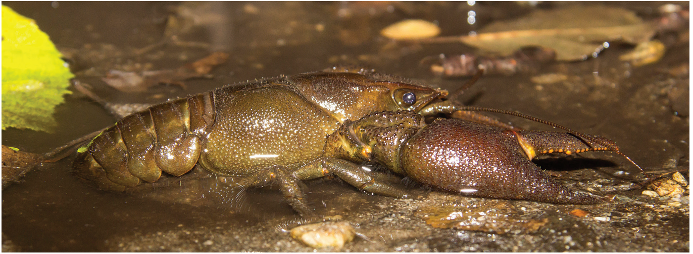
Fig. 1 - Adult of white-clawed crayfish found in this study. / Adulto di gambero di fiume osservato nel corso della presente indagine.

2003). In total, five field survey sessions were carried out, two in daytime (25 April and 26 August), and three during the night (12 August, 31 August and 1 September).