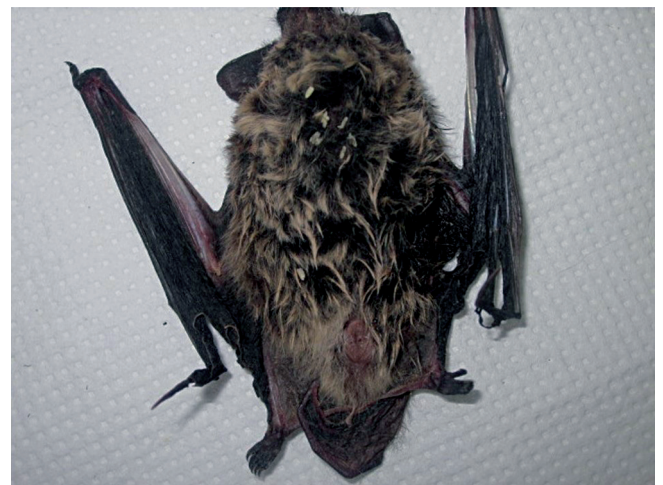
Fig. 4 - One of the four Savi's pipistrelles killed by RNPs in Reggio Emilia. / Uno dei quattro pipistrelli di Savi uccisi da parrocchetti dal collare a Reggio Emilia.