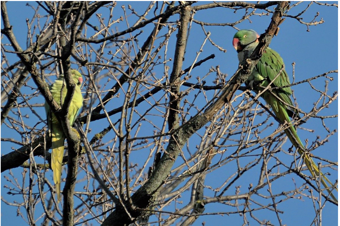
Fig. 1 - Male individuals of ring-necked parakeet (left) and Alexandrine parakeet (right) in Reggio Emilia. / Individui di sesso maschile di parrocchetto dal collare (sinistra) e parrocchetto di Alessandro (destra) a Reggio Emilia. (Photo: / Foto: S. Manfredini).

(percentage of consumed fruits on the total per tree) was recorded in September 2019 and September 2020 at the same 16 persimmon trees distributed throughout urban green areas. Even if the diet of RNP and AP includes a wide range of vegetal items, we chose persimmons, large-sized orange fruits persisting on bare branches in fall, as being easier to be monitored with respect to other cultivated species. However, it would be important to quantify the total damage to crops and orchards by introduced parrots.