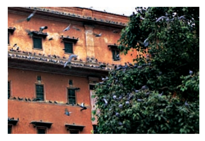
Fig. 1 – A picture from the inner city of Kathmandu (Nepal) showing a synanthropic colony of rock doves ( Columba l. intermedia ). / Colonia sinantropica di colombi selvatici ( Columba l. intermedia ) presente nella città di Kathmandu (Nepal).

This is the case in the several places where we have recently observed groups of synanthropic rocks such as, for instance, in the region of Abruzzo (Opi, Chiauci, Civitella Alfedena), Calabria (Civita) or Sardinia (Castelsardo, Se-