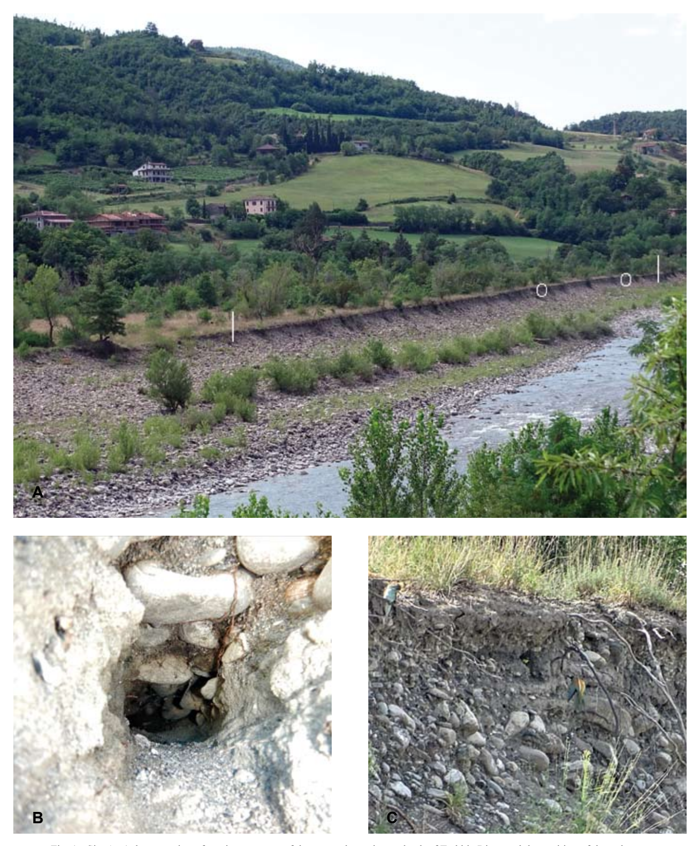
Fig. 1 - Site A: a) the extension of nesting attempts of the new colony along a bank of Trebbia River and the position of the only two successful nests; b) a 40-cm excavation attempt, example of failure because of unmovable pebbles; c) the successful nest close to the first excavation attempt (see Tab. 1), with a fledgling at the top left of the photograph, 18 July. / Sito A: a) L'estensione dei tentativi di nidificazione della nuova colonia lungo una sponda del fiume Trebbia e la posizione dei due soli nidi riusciti; b) un tentativo di scavo di 40 cm, esempio del fallimento dovuto a ciottoli inamovibili; c) il nido riuscito adiacente al primo tentativo di scavo (vedi Tab. 1), con un giovane uscito dal nido in alto a sinistra, il 18 luglio.