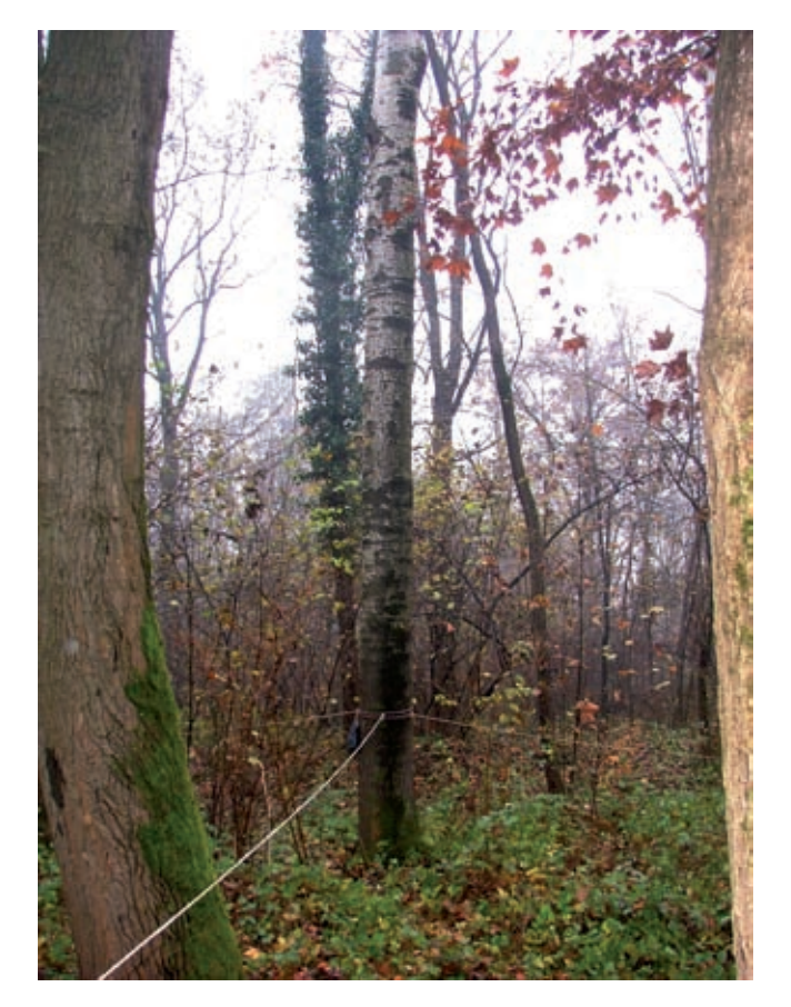
FIg. 4 - .Nest tree (Popolus alba) in territory n. 9 (C area), close to Lake Varese, at the altitude of 245 m a.s.l., the lowest one in which we found a breeding pair in the ash-alder forest. In the photograph are visible some of the ropes of 20 m used to delimitate the 0.12 ha circle, where we measured the forest parameters.

tor of the province, which comprises an higher level of urban cover than sector A and B; precisely in the area of territory n.9 (Fig. 4), in the years 2000/2001 we studied (Saporetti & Guenzani, 2004) the whole bird community of a patch (15.9 ha) of unmanaged alluvial wood ( Alno- Padion - Salicion albae formation): the species pool does not included the Black Woodpecker, although the mature wood already hosted a rich population of the commonest Picidae ( Dendrocopos major, Dendrocopos minor, Picus viridis ). In 2010, when we censused the successful breeding pair, the nest tree was only 160 m from the nearest