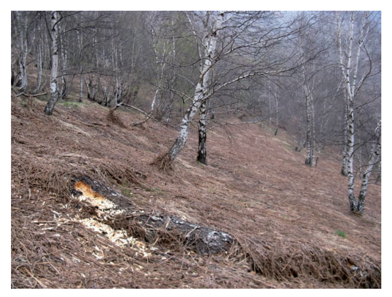
Fig. 3 - Feeding area in the mountain birch woodland of the SCI Val Veddasca: in foreground a wide feeding hole in a rotten log of birch, with wood chips scattered around.

clear evidence of feeding holes and signs in the rotten wood (stumps, snags and logs); in Switzerland the increase of the populations (period 1990-2008) of several forest species such as Black Woodpecker, Middle and Lesser Spotted Woodpeckers, Willow and Crested Tit, has been directly related (Mollet et al. , 2009) to the increase of the quantity of deadwood, thanks to a "close-to-nature" approach to forest management. This species is increasingly adapting to the environmental mosaic of the central sec-