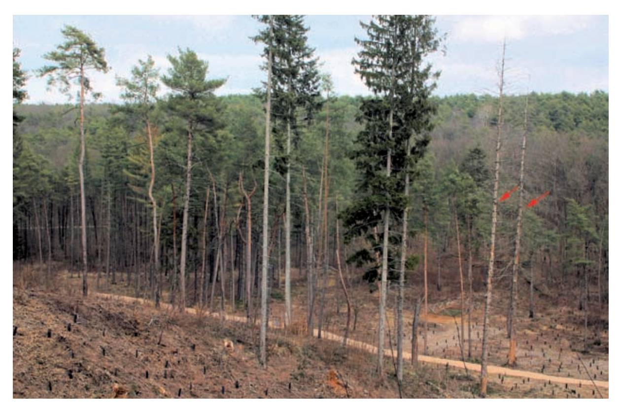
Fig. 2 - Nest area of first territory (n.1, A area and Tab. 3) found in the Pineta of Appiano Gentile e Tradate Park: the nest trees are the two spruce on the right (pointed with red arrows), felled after forestry sanitation operations.